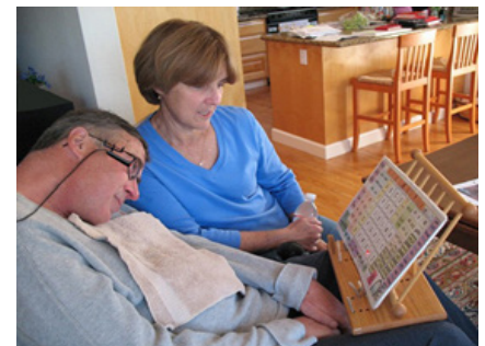
(Above: Photo of communication board)

Speech-language pathologists (SLPs) work as part of a multidisciplinary team to create customized treatment plans for clients. Choosing an AAC system is based on the individual’s communication needs, patterns and capabilities (Justice & Redle, 2014, p.128-9).